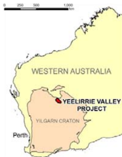
Figure 1 – Location of the Yeelirrie Valley project

Work is progressing on the anomalies identified by the biogeochemical survey. Analysis and ranking of these anomalies during the year resulted in a reduced tenement holding. The project now comprises 5 granted exploration leases (Table 1, Figure 2) that are located within the catchment of the Yeelirrie palaeochannel and are located upstream from the former BHP-Billiton Yeelirrie uranium project.